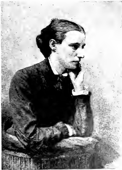
ELIZABETH STUART PHELPS WARD.

terested in all philanthropic work, and she gives much time, labor and money for benevolent interests. Her circle of readers is a large one and is constantly growing.